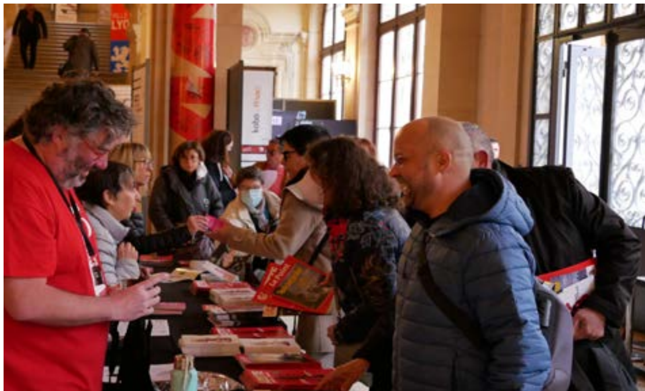
Palais de la Bourse - Hall - Volunteers

In 2022, 3,300 pupils and students read books written by our invited authors and took part in the short story writing competitions, the meet and greets with authors, and the Great Investigation in the city.