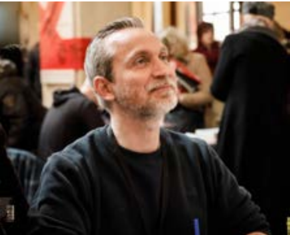
Olivier Norek