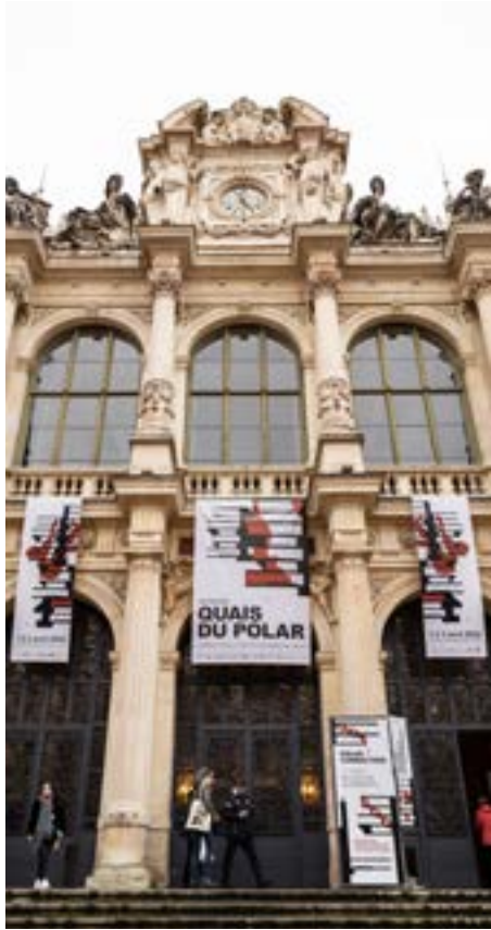
Palais de la Bourse - Facade