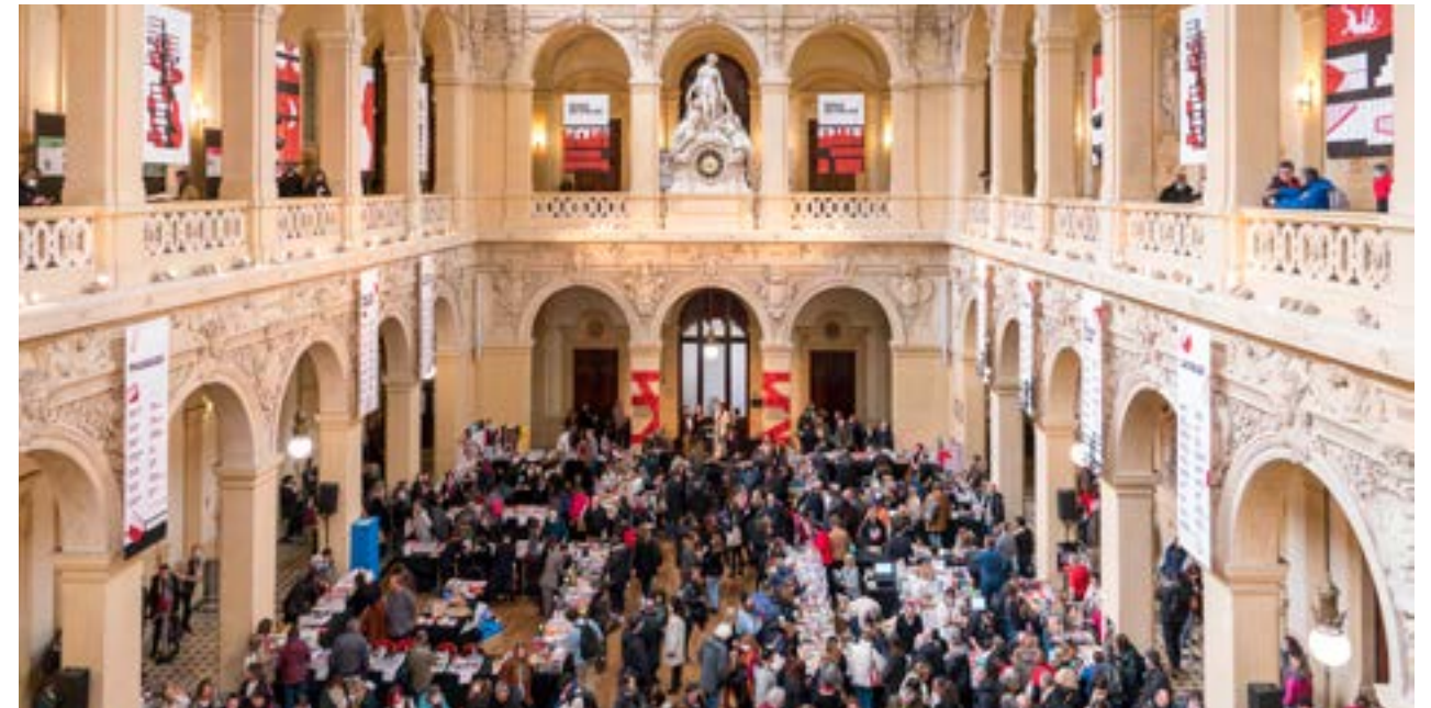
Palais de la Bourse, Salle de la Corbeille - Grande Librairie du polar