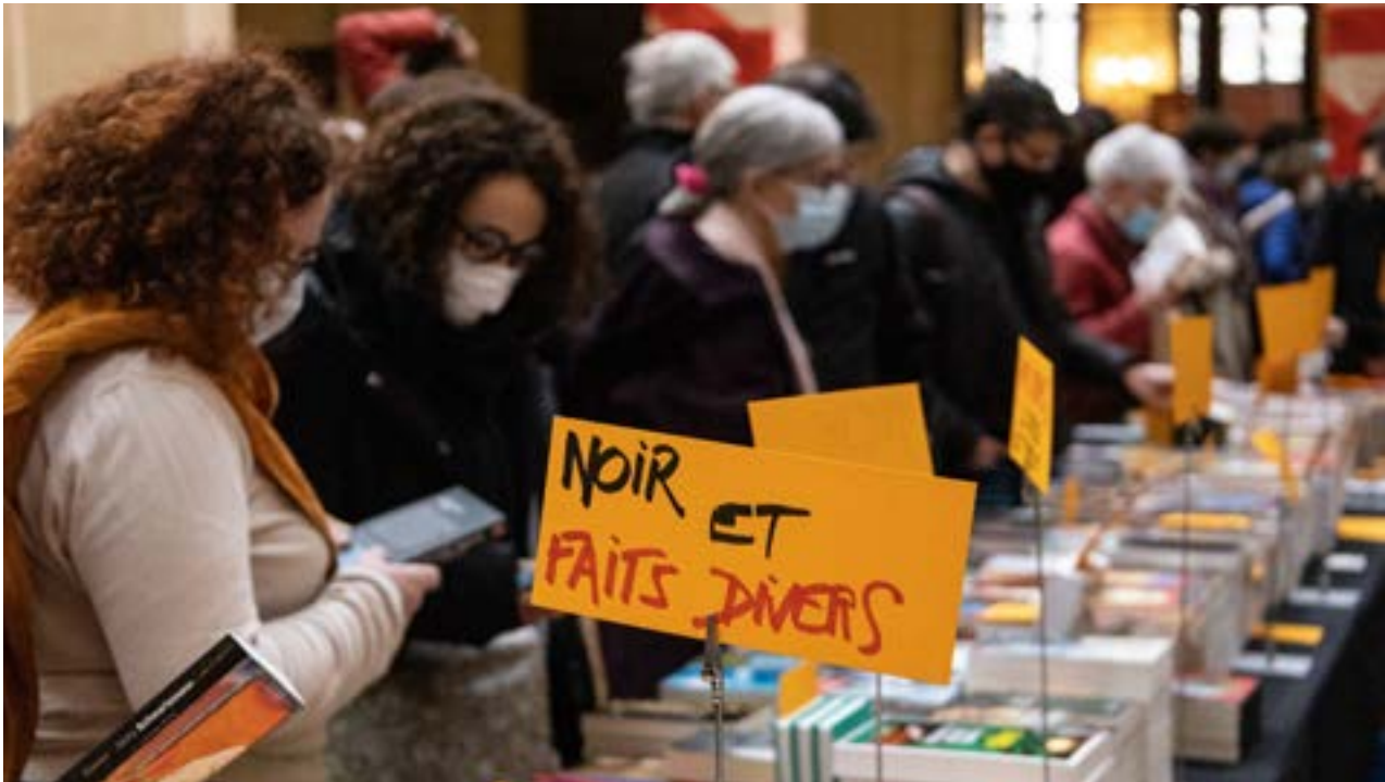
Palais de la Bourse - Atrium - Bénévoles

James Ellroy, Dennis Lehane, David Peace or Michael Connelly... are regularly listed among the greatest contemporary authors. And novels by Dan Brown, Jean-Christophe Grangé, Harlan Coben or Patricia Cornwell... are often ranking first among best sellers.