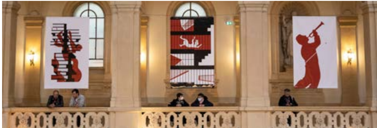
Palais de la Bourse - Passageway

Devoted to organising an event that can be enjoyed by everyone, Quais du Polar decided to create an accessibility division within its team in order to provide a tailor-made festival experience to people with disabilities. An “accessibility supervisor” was present throughout the festival to provide assistance to people with disabilities and help them navigate through the event. During the three days of the festival, Quais du Polar introduced various measures to make the festival accessible to all: 3 meetings were translated into French sign language, 2 cinema rooms and 2 conference rooms were equipped with loop amplifiers or Fidelio systems.