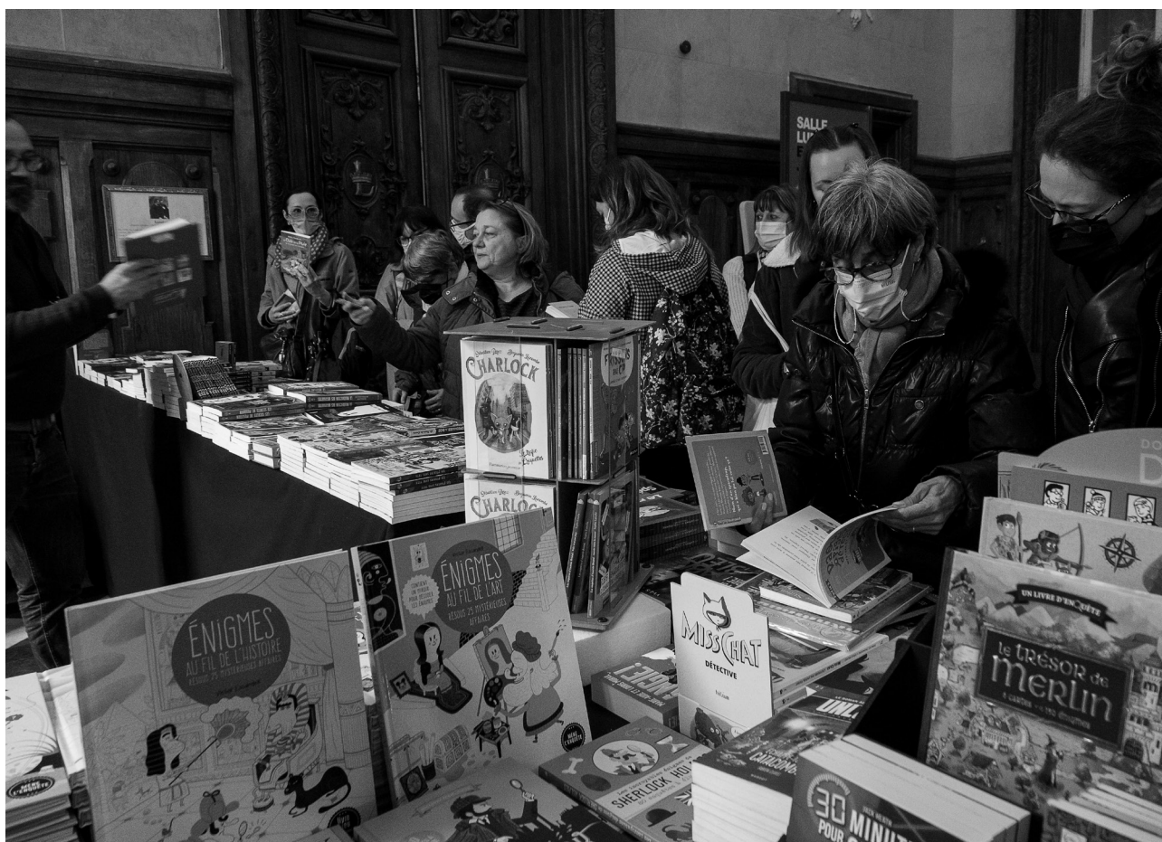
Espace jeunesse

As Robin Cook once said, "April is the cruellest month" ... for crime fiction!