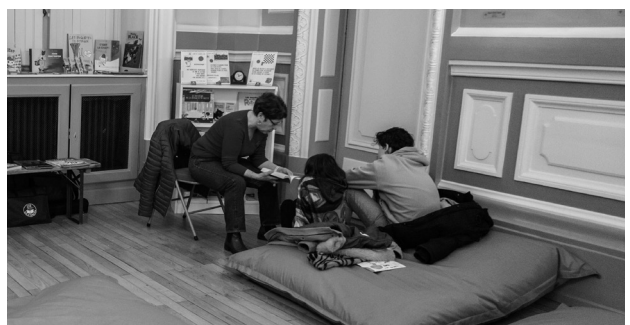
Palais de la Bourse - Lire et Faire Lire

A beautiful culinary experience will take place: festival-goers will be able to discover Barcelona's cuisine in the company of authors Rosa Montero, Olivier Truc, and Carlos Zanón, who will all talk about the place that Barcelona holds in their work and their lives.