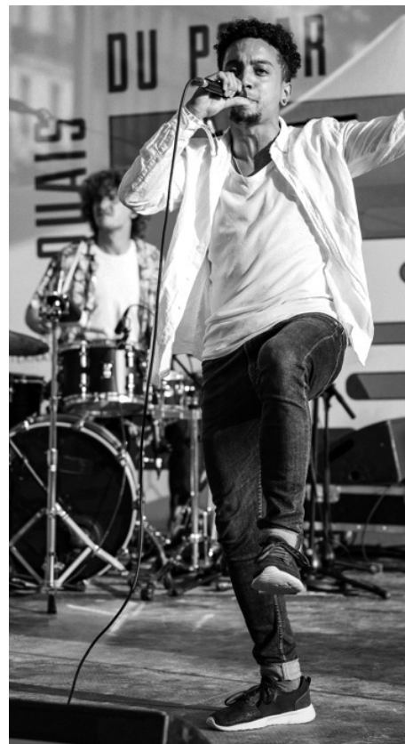
Scène des Quais - Concert Cyrus